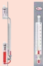
1235 Series Panel Mounting