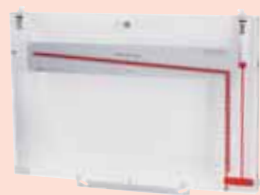
424-10 Inclined-Vertical Manometer.

Ranges And Dimensions — Suitable for Total Pressure up to 100 psig, Temperatures up to 150°F